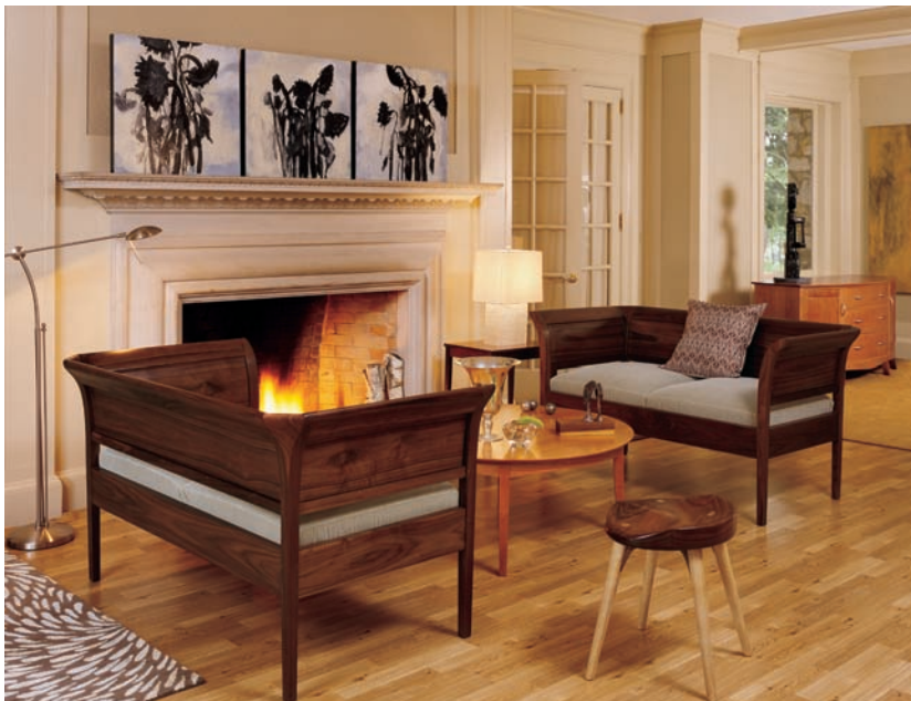
Sofia Two Place Sofa, 2000, cherry, 32" x 58" x 31"