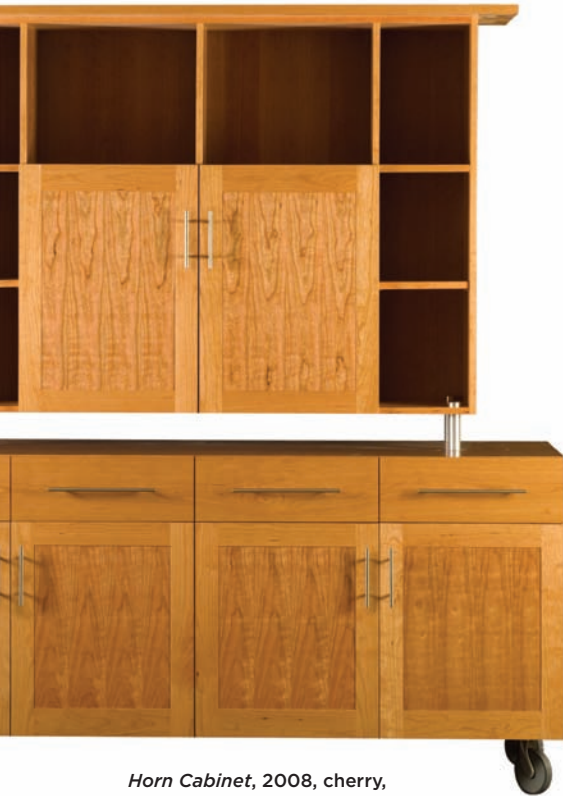
Horn Cabinet, 2008, cherry, brushed aluminum, steel, and rubber, 84" x 24" x 78"

FOR MORE GREGG LIPTON: LIPTONFURNITURE.COM , HOMEPORTFOLIO.COM