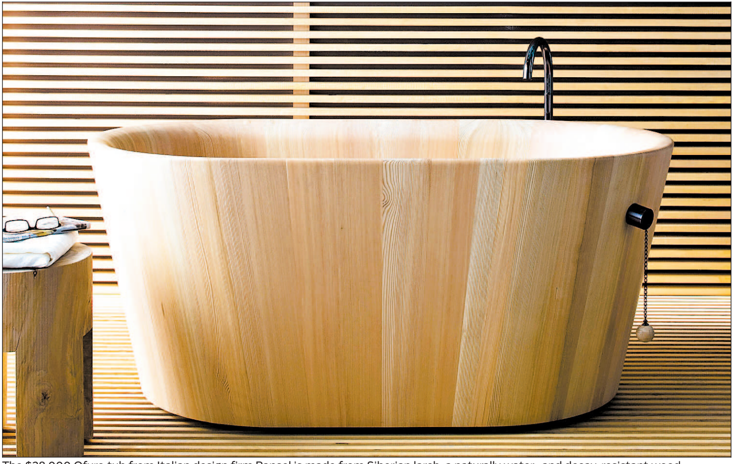
The $28,000 Ofuro tub from Italian design firm Rapsel is made from Siberian larch, a naturally water- and decay-resistant wood.